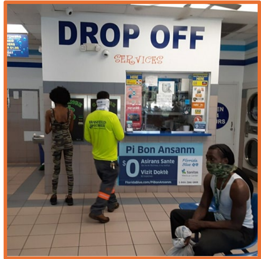
Laundromat Place Based Billboards PRODUCTION SPECIFICATIONS